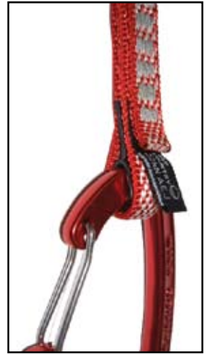
The 'Tadpole' can be clearly seen

NOTE: These express 'Tadpole' slings are offered on all Qds 10mm & 12mm as standard at no extra cost.